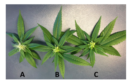
Fig. 1. Photograph of (A) an allfemale inflorescence, (B) an inflorescence with about equivalent male and female flowers, and (C) an all-male inflorescence from female cannabidiol (CBD) hemp strain C plants.

The experiment was a randomized complete block design with two factors: three STS treatments and three strains, with three replicates for each factor combination. Each potted plant was an experimental unit. One week after the third and final STS spray, the number of male and female flowers per terminal inflorescence was counted for two terminal inflorescences per plant, which were averaged, and the percentage of male flowers per inflorescence was calculated for each plant. The degree of masculinization was evaluated using a visual rating. Each inflorescence per plant was rated for degree of masculinization using a scale of 1 to 5, where 1 represented 0% male flowers (allfemale inflorescence), 2 represented 1% to 30% male flowers (strongly female inflorescence), 3 represented 31% to 60% male flowers (about equivalent male and female flowers), 4 represented 61% to 99% male flowers (strongly male inflorescence), and 5 represented 100% male flowers (all-male inflorescence) (Fig. 1). SAS software (version 9.2; SAS Institute, Cary, NC) was used for statistical analysis.